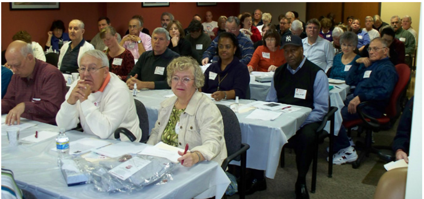
Group photo of 2009 Conference Attendees.

You will get transportation to and from the airport. We will try to coordinate group shuttles in respect to various flight arrivals and departures. However, If you chose to fly to Chicago and wish to take a your own taxi to and/or from the airport, the hotel uses American Taxi Dispatch for their clients' airport needs. The fare from O'hare to the hotel runs $25.00 one-way. From Midway it is about $40.00 with an additional $2.00 per person. You may call and reserve a taxi before you arrive to secure a flat rate. To contact American Taxi Dispatch simply call 847-259-0276 or click into www.americantaxi.com to make reservations. If you choose to take a city taxi from the cab stand at the airport, the fares from O'hare have been $40.00-$60.00 and $80.00 from Midway Airport to the hotel. These are city taxis and are metered. They do not run on a flat rate.